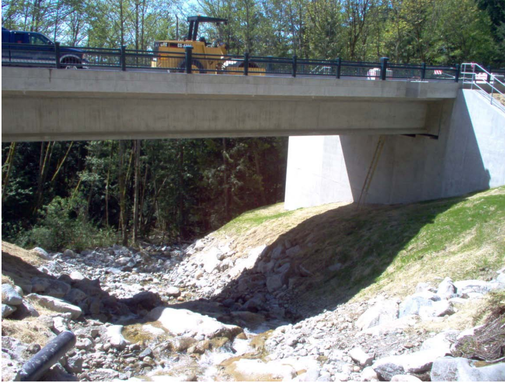
Marr Creek Bridge – British Properties West Vancouver