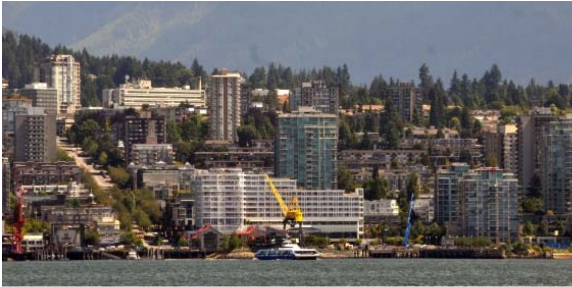
The North Vancouver waterfront.

North Vancouver was recently named the second-best B.C. city to work in.