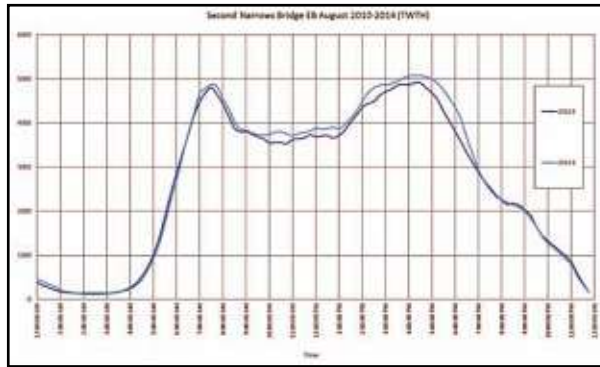
A graph shows traffic volume by hour, eastbound on the Ironworkers Bridge.

But, even if we untie all the traffic knots before the bridge, the Ironworkers itself