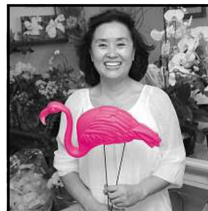
ROSA FLORAL DESIGN 604-929-9813