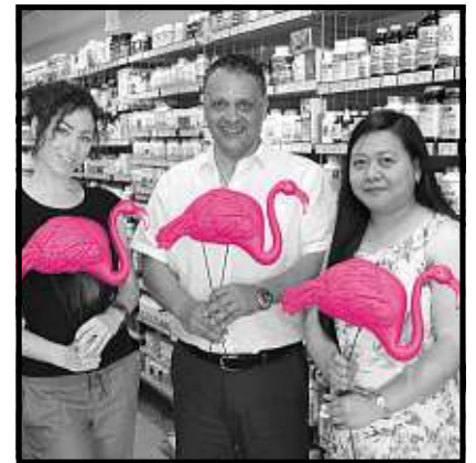
HEALTH WORKS 604-987-0104