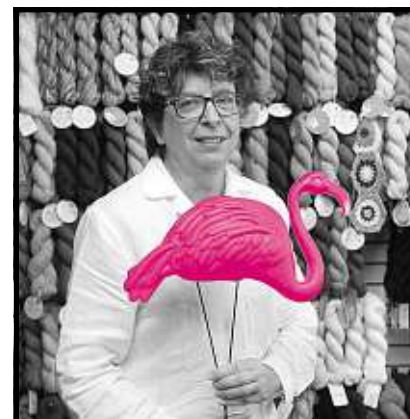
URBAN YARNS 604-984-2214