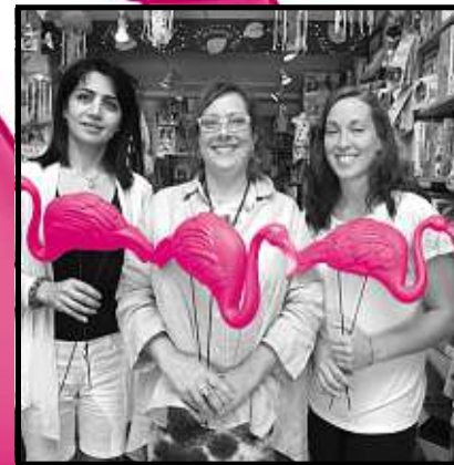
BC PLAYTHINGS 604-986-4111