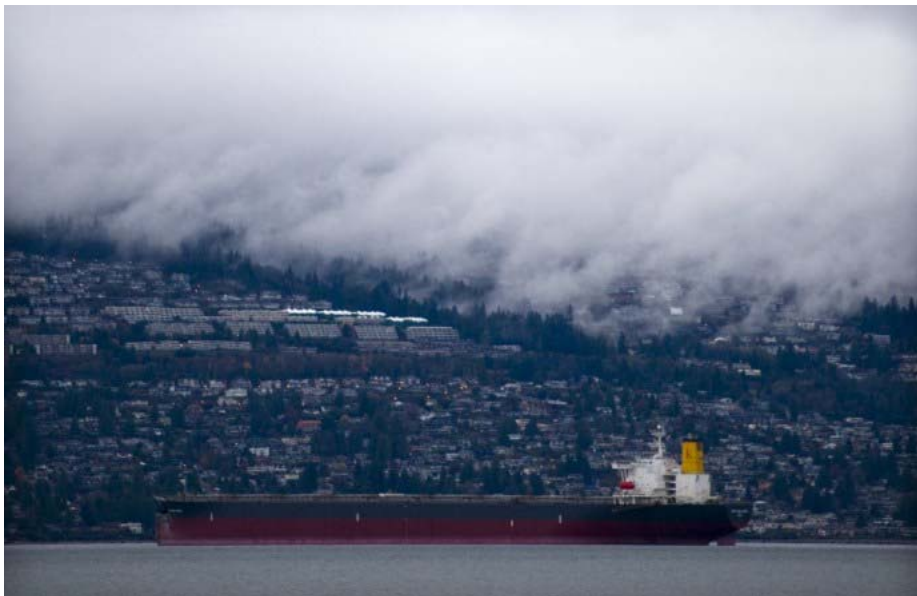
The District of North Vancouver is way better than the City of North Vancouver.

Ottawa, Burlington, Ont., St. Albert, AB. (No. 1 in 2014) and Blainville, Que round out the top 5.