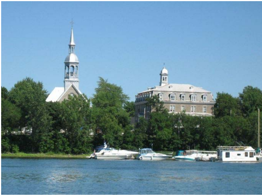
Skyline of Boucherville, Quebec

Boucherville, Que., a suburb of Montreal, was named top place to live in Canada, up from sixth place in 2014.