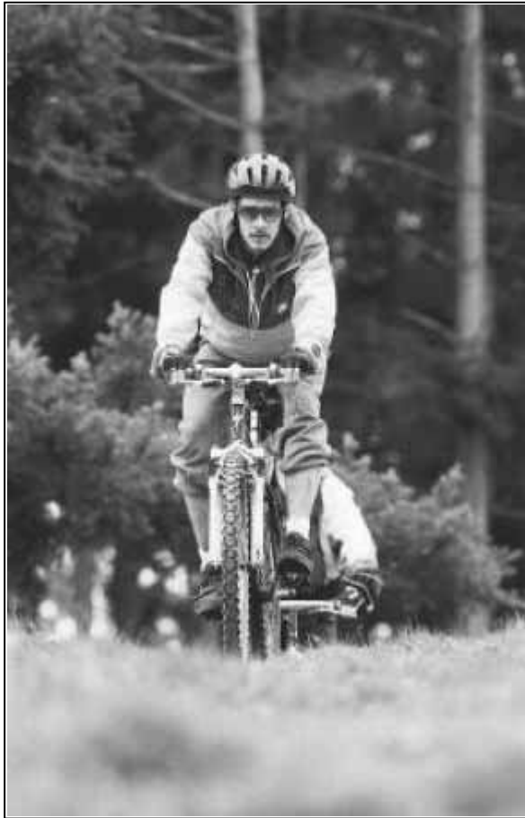
Mountain bikers are upset over the removal of structures in Watershed Park.

"They haven't followed through," Campbell said.