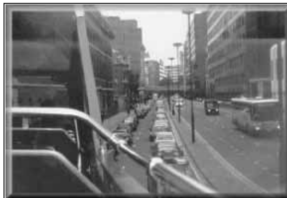
London has one of the busiest city centres in the world, with more than one million people entering its core each morning.

Last Friday, TransLink released details of a contingency plan to help pay for its $4-billion transportation plan should a federal scheme to share gas tax revenues with cities fall through. In it, the transportation authority proposed increasing regional gas taxes, charging an environmental fee (possibly replacing AirCare), and/or instituting a congestion charge - a toll between 10 and 60 cents per trip to and from the Burrard Peninsula (Vancouver, Burnaby and New Westminster).