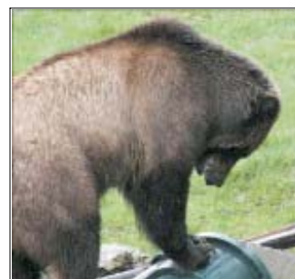
A bear can knock this bin over and jump on it, but still can't get inside it, during testing of three types of garbage bins.

Participants — as well as the garbage contractors who collect the trash each week — will be asked to fill out surveys and provide feedback throughout the year about how the bins hold up. At the end of the year, the best bin wins.