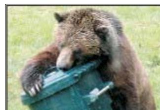
The bear unsuccessfully tried chewing its way through one of the garbage bins that will be part of the Coquitlam project.