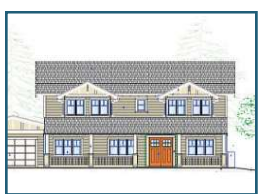
This rendering provided by applicant for illustrative purposes only. The actual development, if approved,